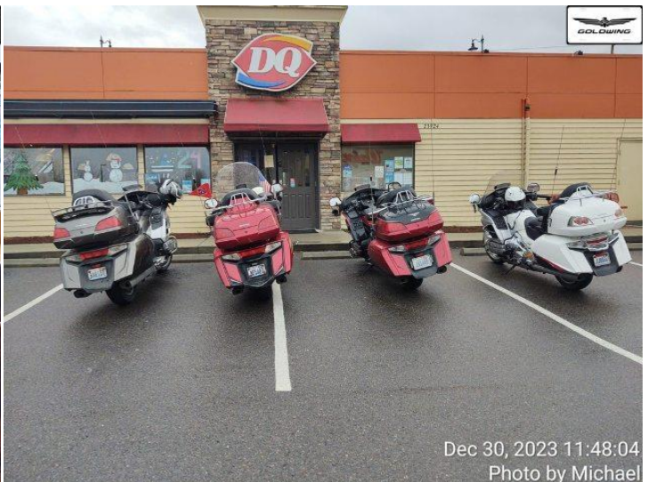
Dec 30, 2023 11:48:04