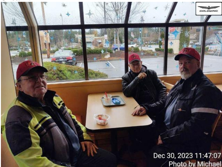
Dec 30, 2023 11:47:07