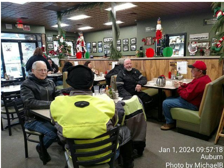
Jan 1, 2024 09:57:18 Auburn