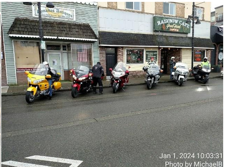
Jan 1, 2024 10:03:31